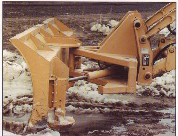
SRP ANGLE DOZER RAMP PLOW (OPTIONAL COUPLER AND SKID SHOES SHOWN)