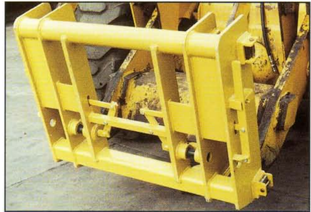
MANUAL PIN LOCKING