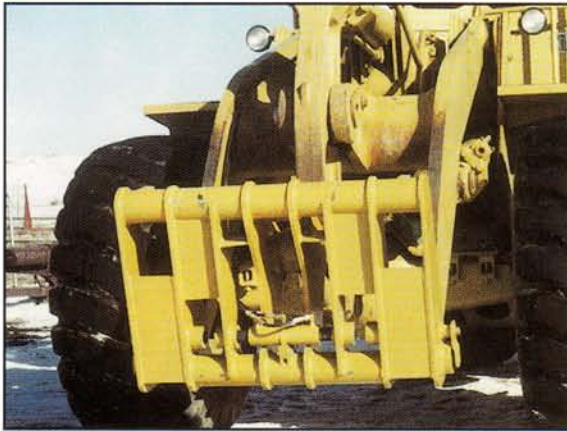
HORIZONTAL HYDRAULIC PIN LOCKING